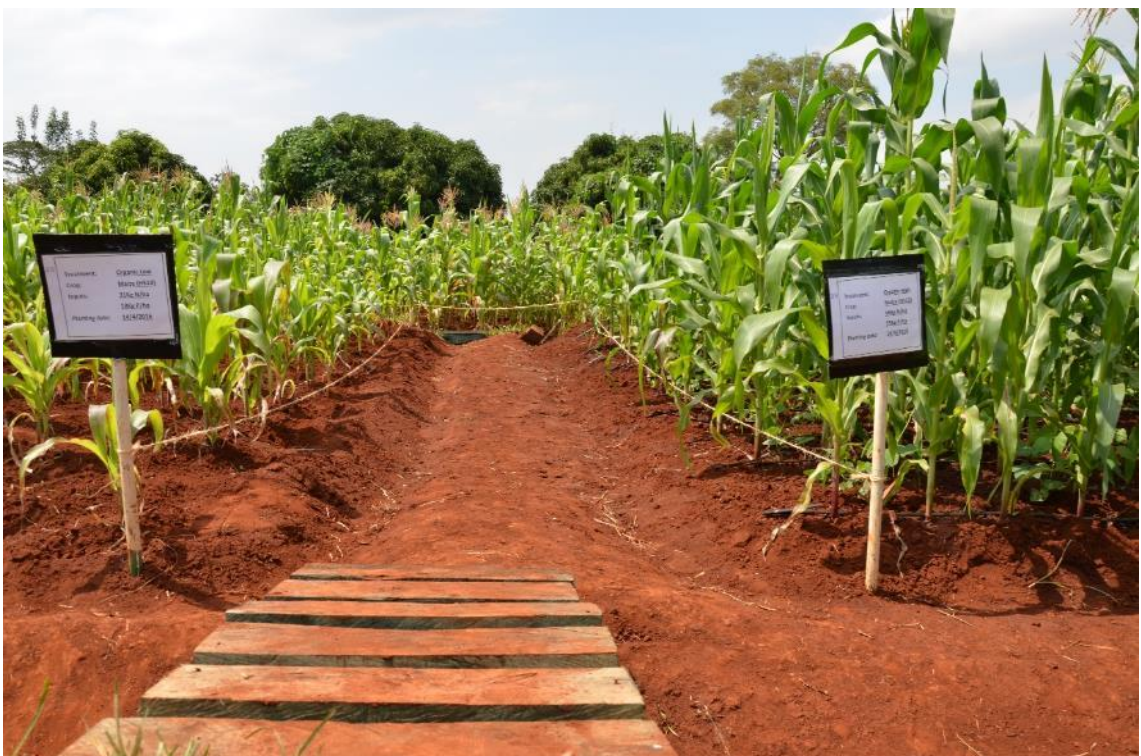
In Kenya, the cropping systems involves maize as the main crop, and legumes, vegetables and potatoes as associated crops, which are highly important for the income and nutrition of the local population.