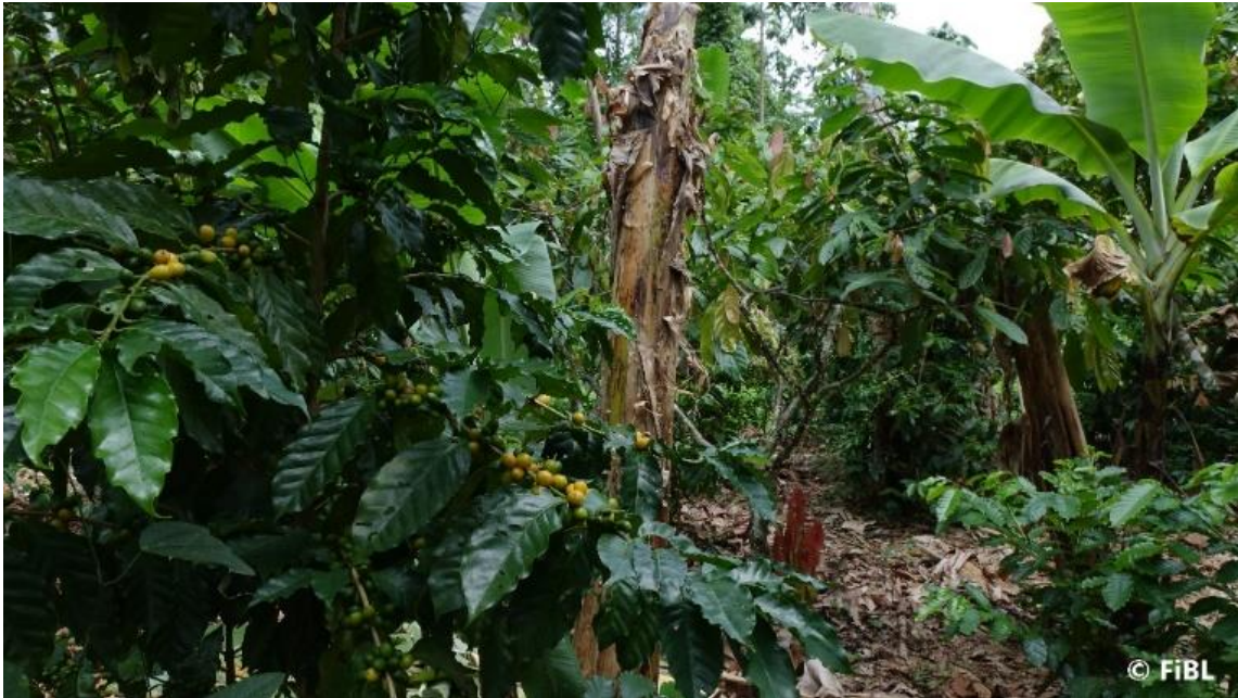
Organic production systems (like the cacao agroforestry system in Bolivia pictured above) are just as profitable as conventional systems through the interplay of cash crops with associated crops (e.g. bananas, curcuma, ginger, maize, peach palm and other fruit trees).